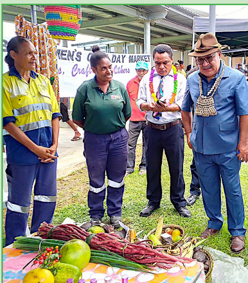
An exhibit by MBE women representatives during the SME launch in Alotau

Former Prime Minister and Ialibu-Pangia MP Hon Peter O'Neil was the special guest who emphasized the importance of SME and MSME (Micro, Small and Medium Enterprise) ventures to reduce poverty and generate income locally. The day ended with cheque presentations by Alotau MP to MiBank and Mama Bank as startup capitals (equity) for SMEs, MSMEs and women group associations in the district.