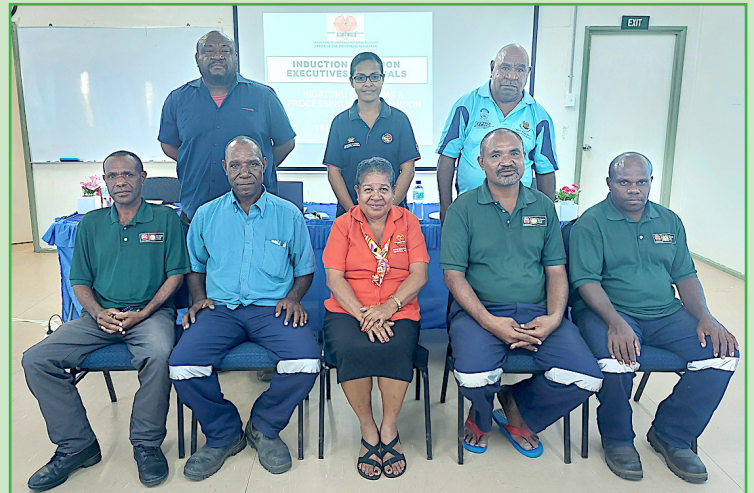
Executives of Higaturu Oil Palms & Processing Workers Union and officials from the Department of Labour and Industrial Relations during an induction and training workshop at HOP on February 18