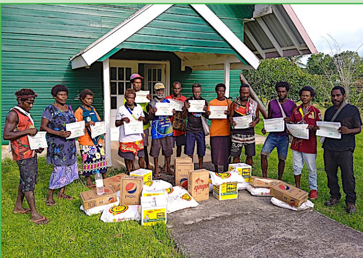
January 2023 winners in harvesting and upkeep under Poliamba's monthly awards initiative, Best Employee of the Month, receiving their certificates and incentives from POL Human Resource