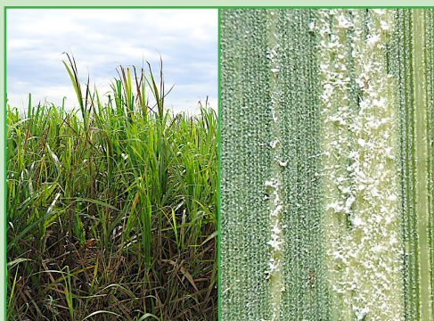
Left: Sugarcane infected by downy mildew, with a few 'jump ups'. Right: Close-up of the underside of a sugarcane leaf showing the "downy" white spores that can spread to nearby plants.

Sugarcane infected with downy mildew develops creamy-white leaf stripes that turn red with age and the leaves can eventually become 'shredded'. The stalks may also elongate, causing 'jump-ups', where the infected plants appear taller than the surrounding uninfected plants. However, general growth of the sugarcane is stunted resulting in economic losses.