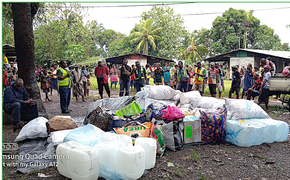
WNB's Smallholder Affairs Department delivering donations for the largest displaced group at Lotogam Plantation in the Talasea area of West New Britain Province on February 11 2023

West New Britain (WNB) has responded with much needed relief supplies to Pangalu growers in Talasea District whose homes were burned down by an unexpected fire on December 20 2022.