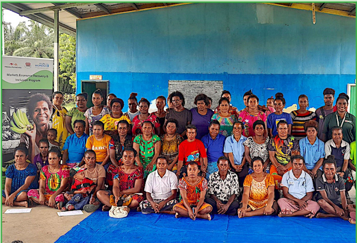
Members of the Milne Bay Estates Women Group Association pose for a group photo during their participation at the Alotau SME launch on February 21 2023