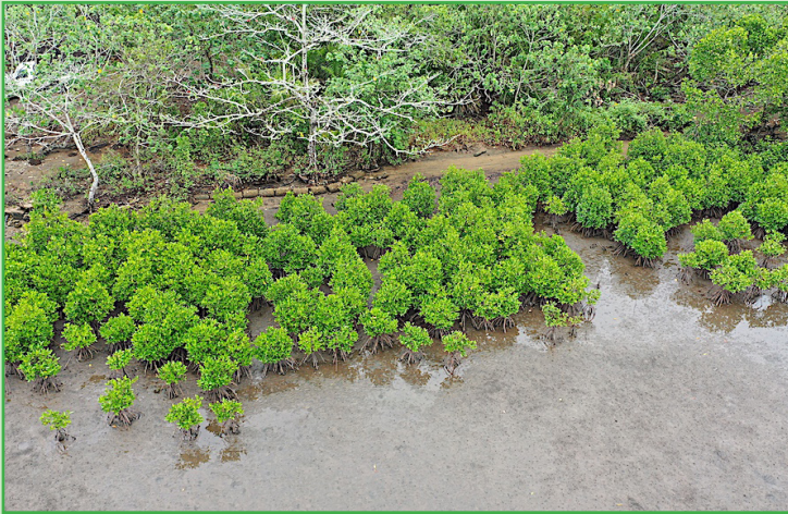
Mangrove establishment along Numundo shoreline (Sept 2022) through a partnership between West New Britain and Mahonia Na Dari, a local NGO, for buffer requirements under sustainability