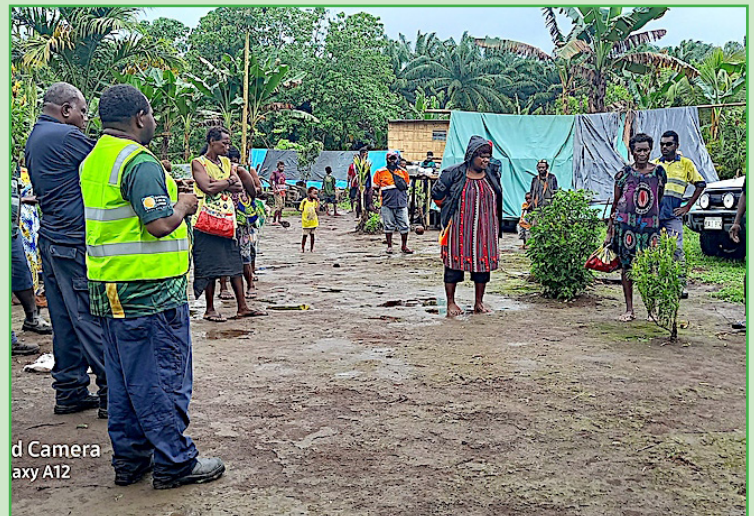
WNB's Smallholder Affairs Department delivering donations at Marihu Care Center in the Talasea District on February 11 to support families whose homes were destroyed by a fire in December 2022