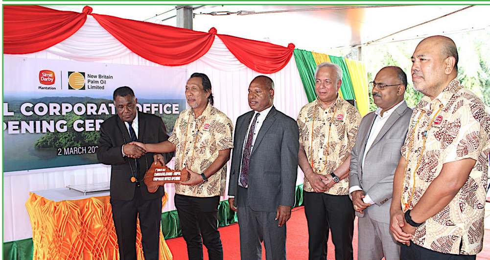
VIPs at Opening of new Corporate Office at Mosa, WNB, on March 2 2023